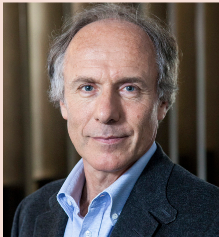
Dr Alan Finkel AO Australia's Chief Scientist

Dr Finkel commenced as Australia's Chief Scientist on 25 January 2016. He is Australia's eighth Chief Scientist. Prior to becoming Chief Scientist, he was the eighth Chancellor of Monash University and the eighth President of the Australian Academy of Technology and Engineering (ATSE).